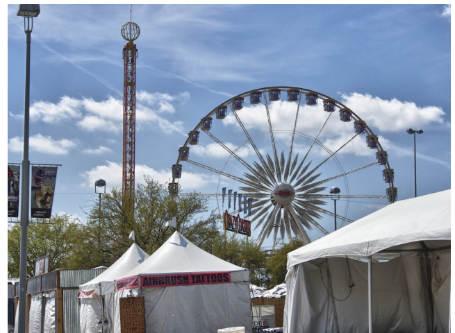
Carnival at RODEOHOUSTON

The higher ISO and shutter speeds are very useful when shooting inside a darkened museum, the HDR bracketing is equally useful when outdoors in bright light where you don't want to blow out the sky but do want to get detail in the shadows, and the built-in WiFi means I can download images to my iDevice without having to use an Eye-Fi card.