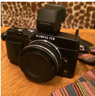
E-P5 with 14-42 f3.5-5.6 EZ Lens

Last month, I decided not to put it off any longer, and so a new gadget entered my life: the Olympus PEN E-P5 . I got it with the optional VF-4 electronic viewfinder, and I also picked up a brand new M.Zuiko ED 14-42mm F3.5-5.6 EZ Ultra Compact lens.