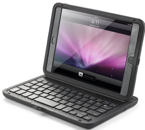
(Airbender Mini, front view)

The Airbender keyboard cases have a detachable section which holds the iPad, allowing you to use the iPad “with” or “without” (the keyboard.) The iPad is completely enclosed, including the screen. I have found that the touch screen works OK with my finger, however using a stylus is a bit problematic. Setting up the Airbender is also a bit problematic, as you have to really work to fit the iPad into what is a really snug case. Once in place, however, it tends to stay in place.