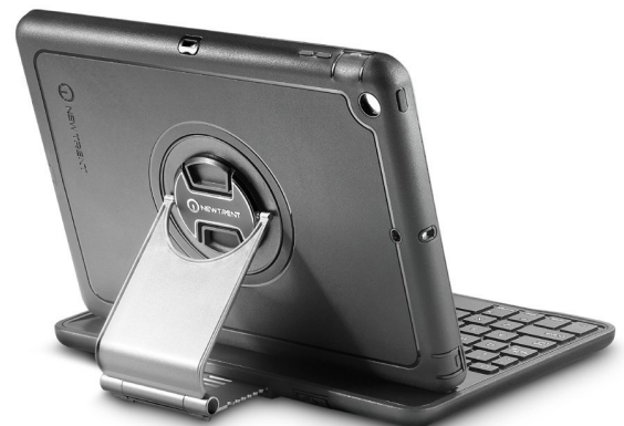
(Airbender Pro, showing hinge)

I have been using both iPads with the Airbenders since they arrived, and I have not felt any need to remove the iPads from their protective shells. The iPads may not be as sleek in these cases, but they are a bit more secure. While not a complete klutz, there are times when my iPad will slip from my fingers, and I am a bit more comfortable knowing they are protected from an unexpected lesson in the Law of Gravity.