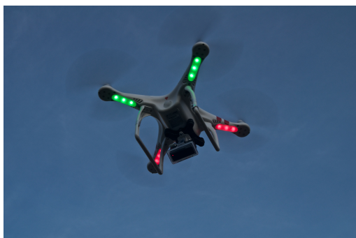
(Upper Left) Copter and Remote (Upper Right) Phantom Hovering (Left) Copter in Flight (Lower Left) Rice and Evergreen (Lower Right) Rice, looking North