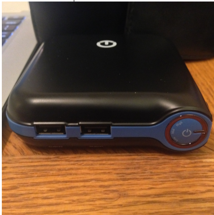
New Trent iCarrier 12000mAh Portable Dual USB Port External Battery Charger/Power Pack

Update: Last month, I wrote about my second impressions of the Macbook Air Lock and Security Skin Bundle. I promised to let you know how it went: early this month, I decided that it had to go. The cracks had grown, and were becoming a hazard for getting a cut on skin (mine, not the Macbook Air's.) I tried to remove the skin, but two of the screws wouldn't budge, so I took the Air to TechOne Centre in the Downtown Tunnel System, where they helped me get the screws out, and they even sold me an Incipio Feather ultralight hardshell case. So far, I like it: keep an eye on this space for a review down the road.