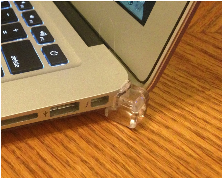
Security Skin's security slot

I will leave the Security Skin on for now, and let you know how it progresses.