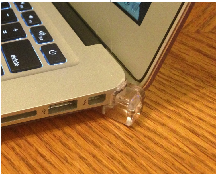
Security Skin's security slot

I really didn't want to wait on this, because I was taking the new Air not only to work, but also to a week long security class: despite whatever you might have heard to the contrary, personal property can - and does - go missing in such places. So, I ordered a Security Skin from the vendor's website, and anxiously awaited for it to arrive.