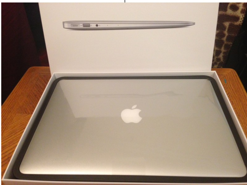
The Unboxing

I got a 13" model MacBook Air with the following upgrades: a Core I7 processor, 8GB RAM, and 256 GB flash storage. I also picked up a LaCie 1TB USB 3.0 drive for my virtual machines, a SuperDrive for those times I need a DVD drive, and several cables/connectors because you can never have too many cables or connectors. To handle the 650 GB(!) of personal files, I ordered a 1.5 TB Mercury On-The-Go Pro from OWC . To permit the simultaneous charging of an iDevice while powering the MacBook Air (really nice when in a hotel room or a class/conference room), I got a PlugBug . Last but not least, because Apple opted to leave out the security lock slot, I picked up a MacBook Air Security Skin and lock combo from MacLocks.com .