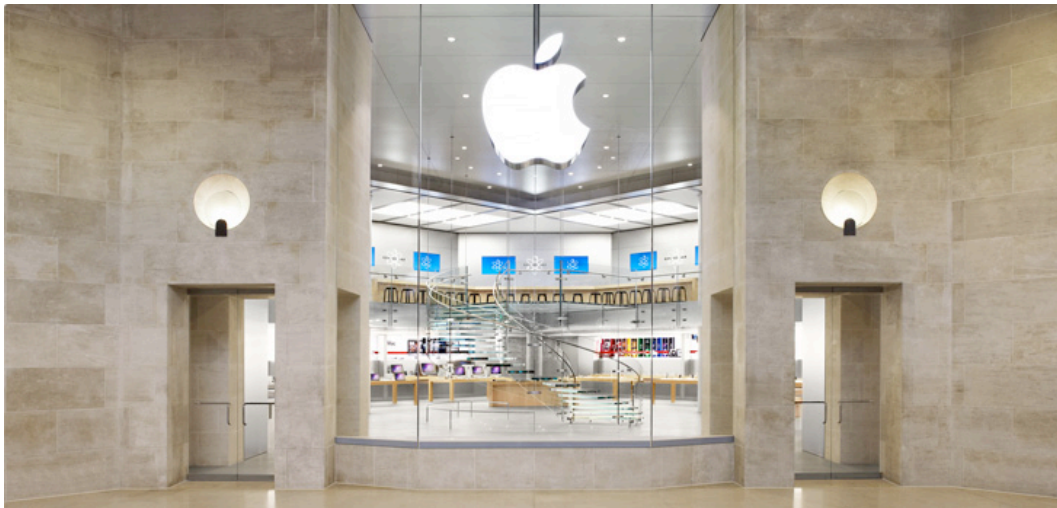
Apple Store Carrousel du Louvre, Paris, France