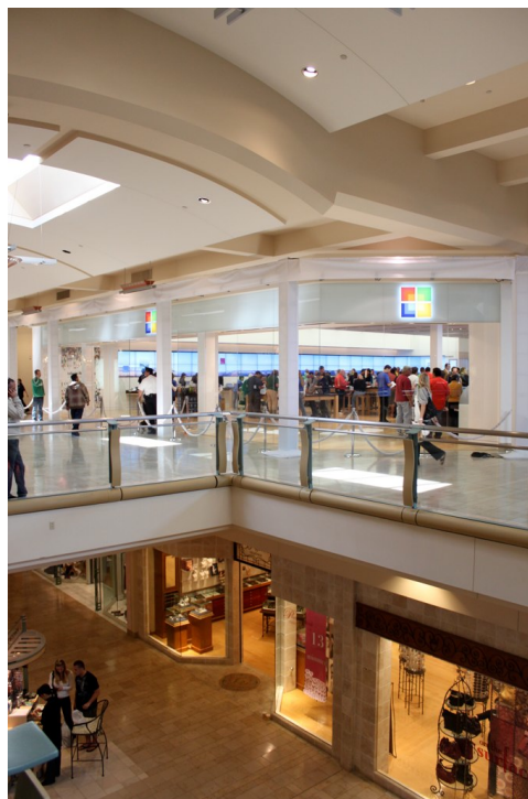
For comparison: The new Microsoft Store in Mission Viejo, CA (360 ft. away from Apple Store already in progress)

You can see more pictures from these store openings and more at: