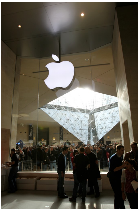
Inside the Apple Store Carrousel du Louvre, Paris, France