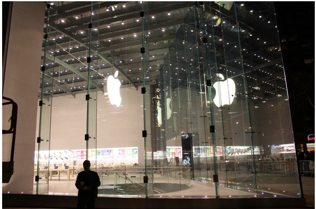
Apple Store Upper West Side, New York City, NY