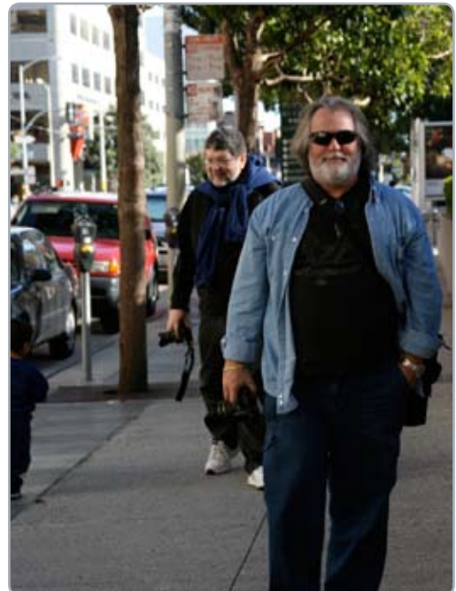
There he was just walking down the street, singing do wa diddy diddy dom diddy do!