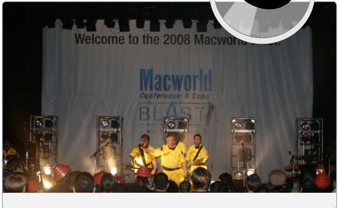
MacWorld Blast Party — "...We are Devo!"

Submit your personal photos to abe@haaug.org