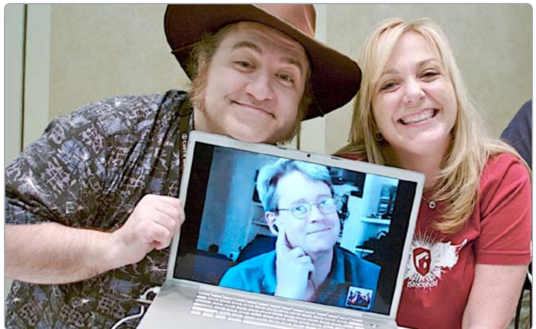
The Cyber Connection