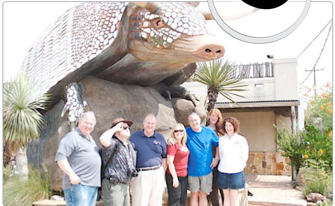
Looking into the Sun

Submit your personal photos to abe@haaug.org