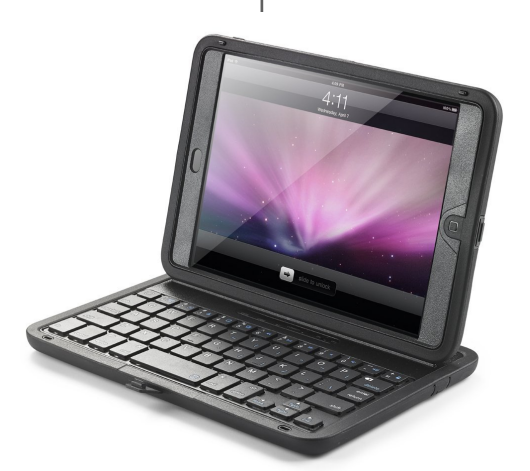
(Airbender Mini, front view)

The Airbender keyboard cases have a detachable section which holds the iPad, allowing you to use the iPad "with" or "without" (the keyboard.) The iPad is completely enclosed, including the screen. I have found that the touch