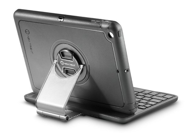
(Airbender Pro, showing hinge)

I have been using both iPads with the Airbenders since they arrived, and I have not felt any need to remove the iPads from their protective shells. The iPads may not be as sleek in these cases, but they are a bit more secure. While not a complete klutz, there are times when my iPad will slip from my fingers, and I am a bit more comfortable knowing they are protected from an unexpected lesson in the Law of Gravity.