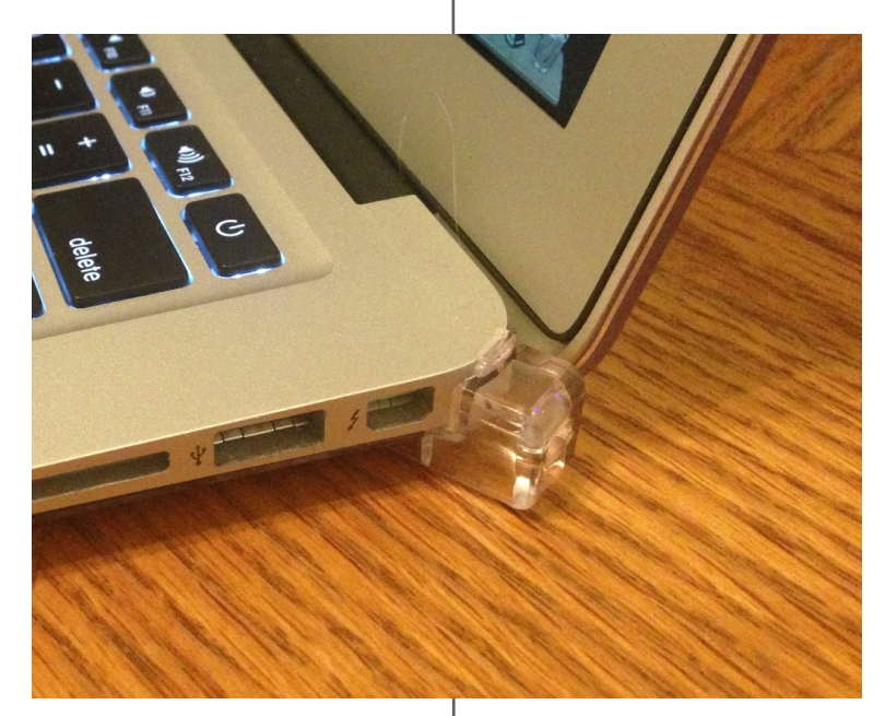
Security Skin's security slot

I will leave the Security Skin on for now, and let you know how it progresses.