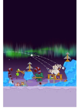
Scenes from Angry Birds Seasons HD

Thanks to the folks at Apple and Rovio, I have it.