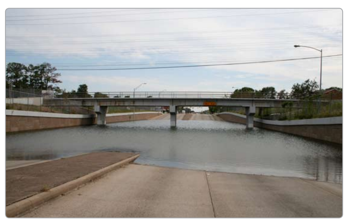
Highway closure.

A perfect hit.