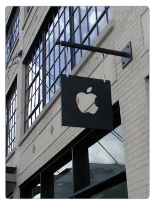
NEW W14th Street Apple Store Sign