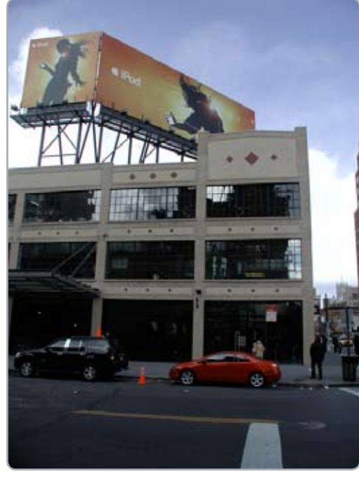
NEW W14th Street Apple Store Billboard