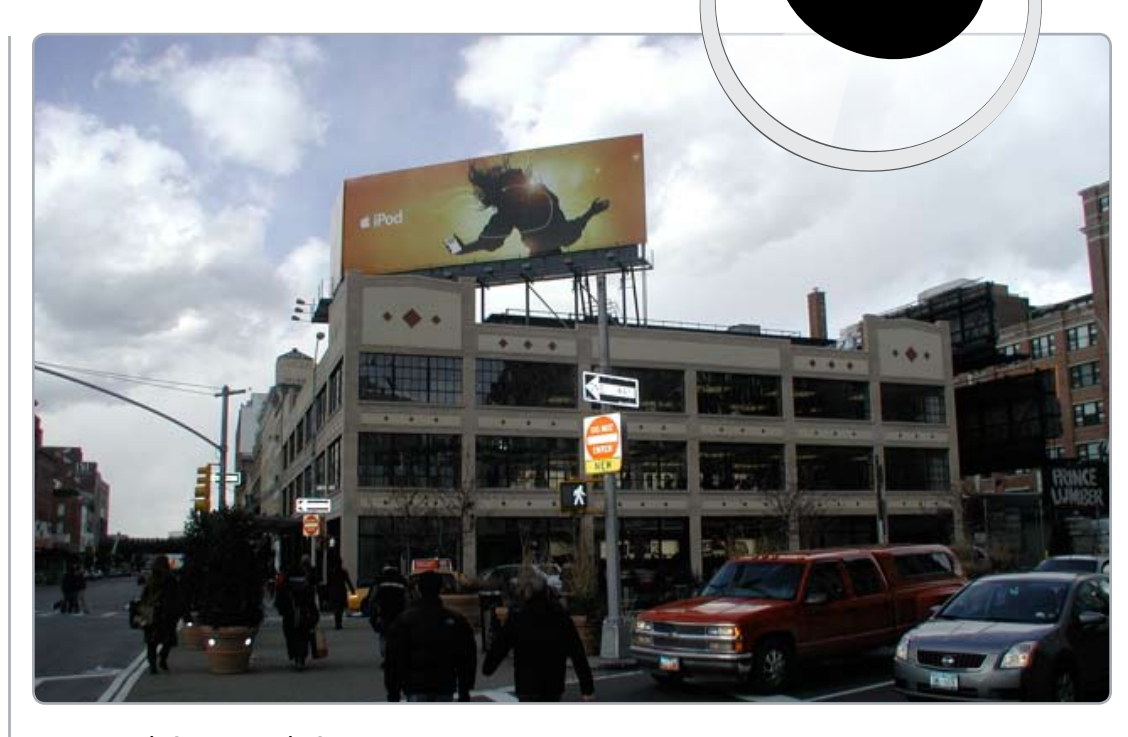
NEW W14th Street Apple Store, NYNY

Submit your personal photos to abe@haaug.org