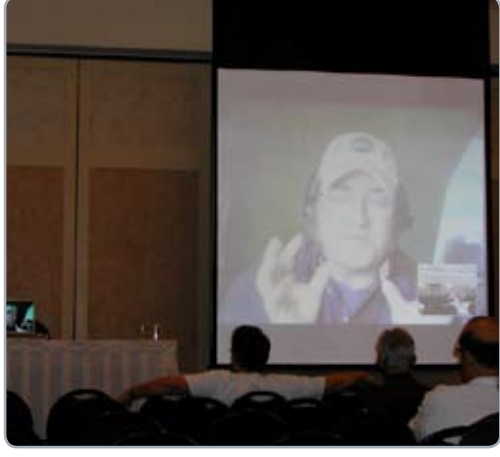
This year's MacFest included many goodies including Andy Ihnatko. via iChat – Courtesy Rex Covington.