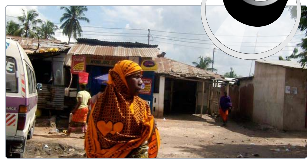
Kilimanjaro, Tanzania.

HAAUGraphy is a way to express and communicate our history through photography. Submit your personal photos to abe@haaug.org