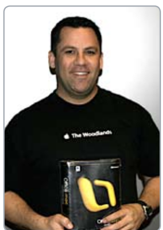
June 2006 Microsoft Office® Professional for Mac give-away winners!