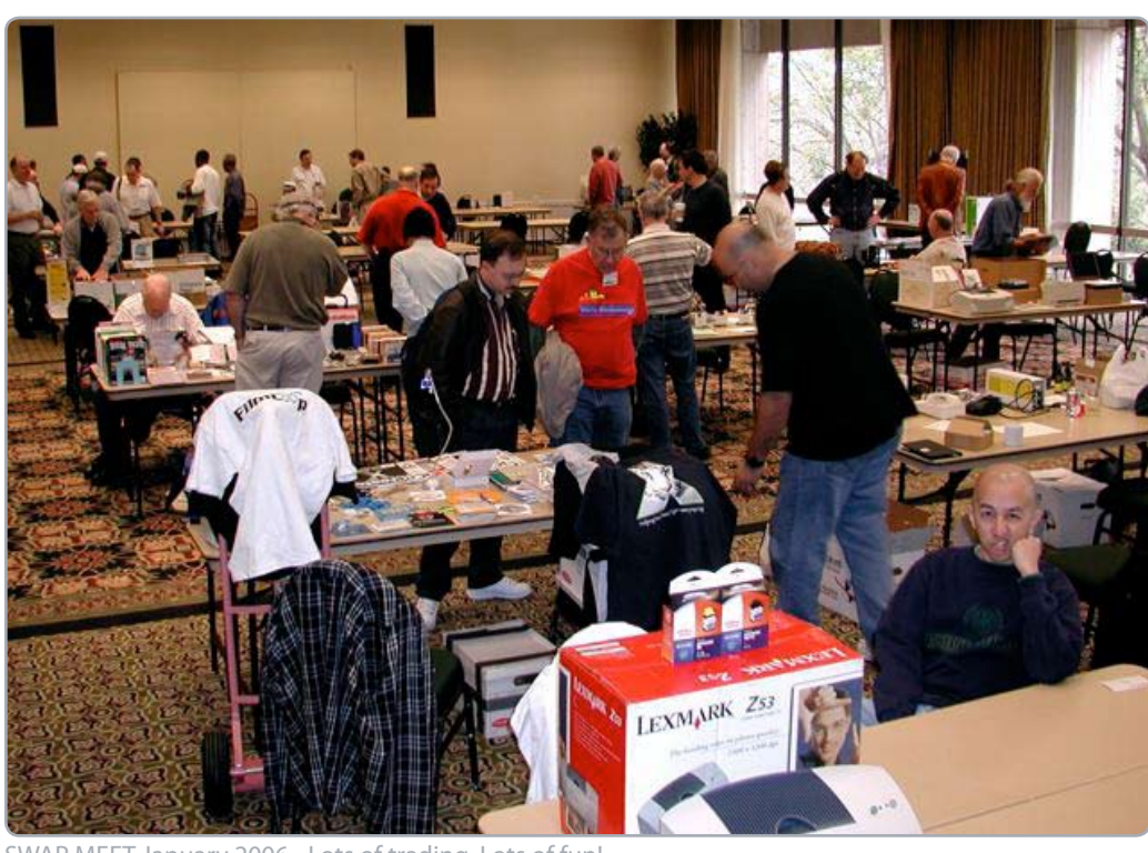
SWAP MEET January 2006 -Lots of trading. Lots of fun!

The age-old saying "One man's trash, is another man's treasure..." is almost an under statement when it comes to this earth-conscious event of reusing those products that play a part in our daily lives. Come one, come all in this bargain event!