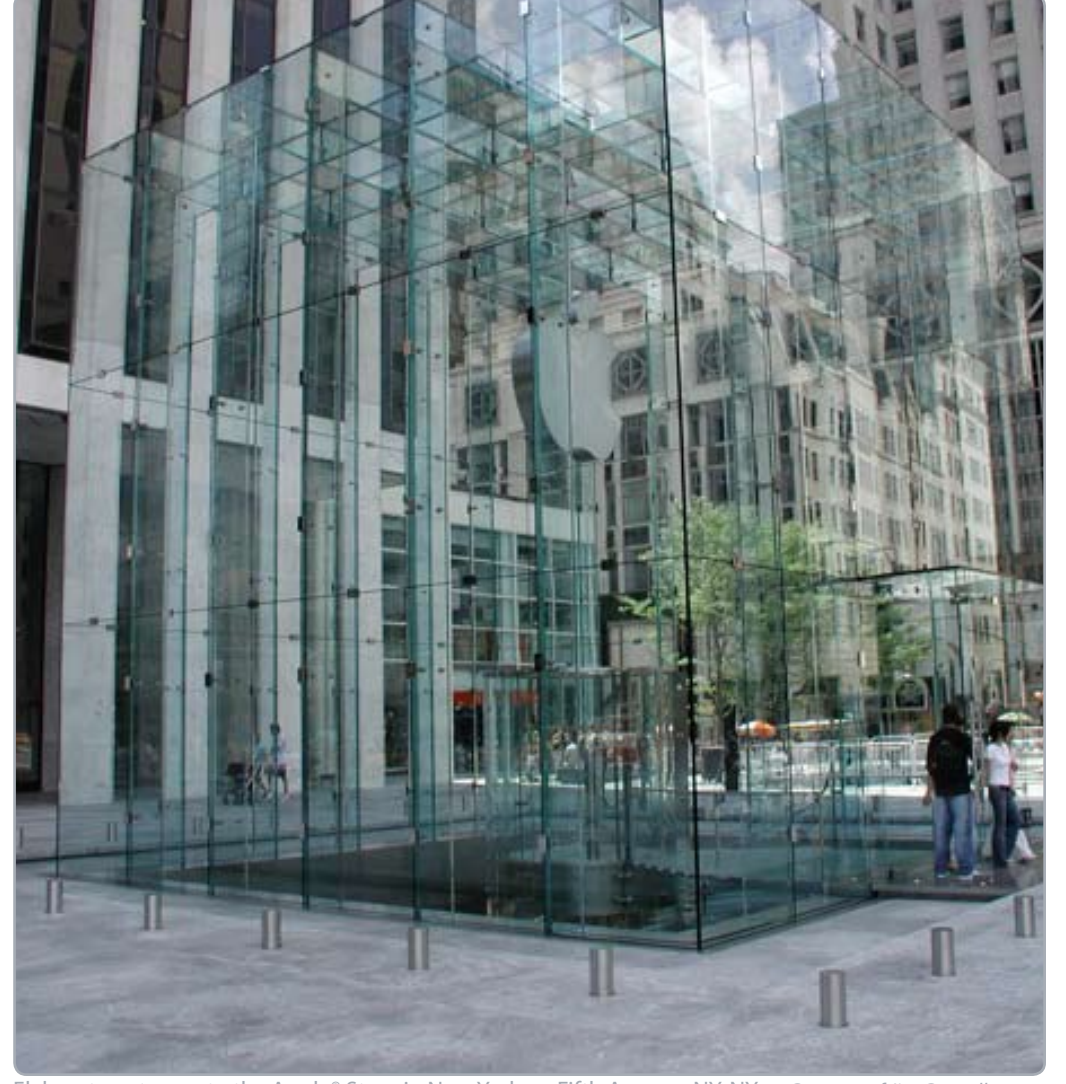
Elaborate entrance to the Apple® Store in New York on Fifth Avenue, NY, NY.