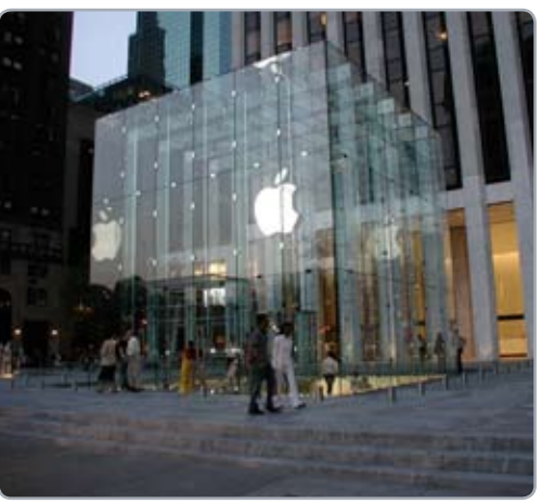
Creative lighting adds to the welcoming effect for prespective customers and passer-bys.