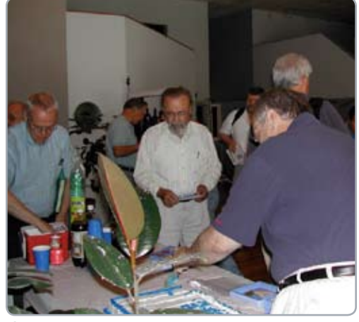
HAAUG celebrates Apple's 30th Anniversory.