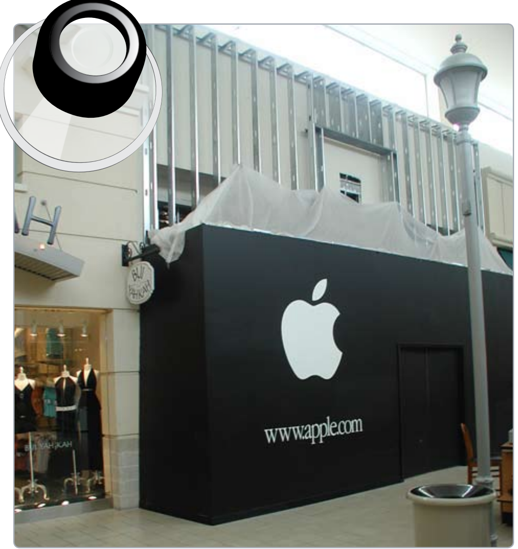
The NEW, anticipated Apple Store is under construction at Memorial City Mall.

A photographic journal of The Houston Area Apple Users' Group