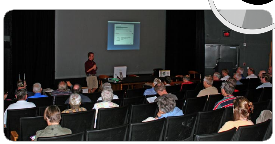
Alsoft presentation at the September General Meeting.