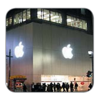
Store Information and photography courticy of Apple Computers