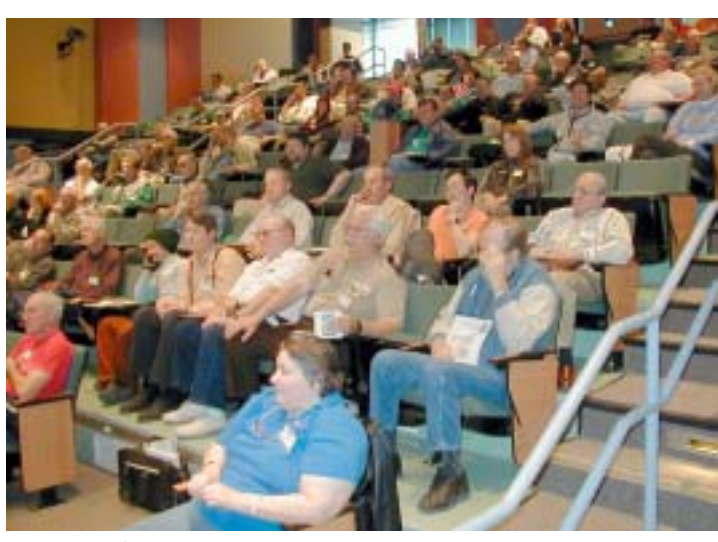
and web-publishing features of FileMaker Pro to a near-capacity crowd attending the February Main Presentation.