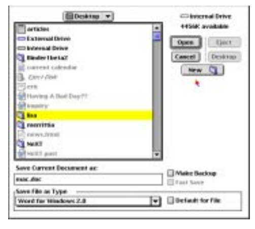
Figure 4. The "Save As" Dialog Box In Word 5

To save the document into a different format on a Mac, use the Save As option in the application and have the right options available. You need to have converters (see the Essential Toolbox section next month for more details) that allow you to save as a different version, and (for Word) these converters are available from Microsoft. Figure 4 shows the Save As dialog box from Word 5.1. You can see where I selected to save the file as a Word For Windows 2.0 file. Yes, it does make it easier if you save the file with the old "8.3" file name convention, even if the other computer has Windows 95.