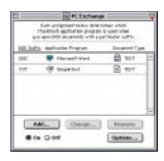
Figure 1. The PC Exchange Control Panel

The first step is to make sure you have a Mac with the system software that will allow it to read and write to PC disks. System 7.5 or later (or 7.1 with Access PC) will allow you to handle those disks. To be able to read PC disks and translate their files, turn on the PC Exchange control panel (see Figure 1).