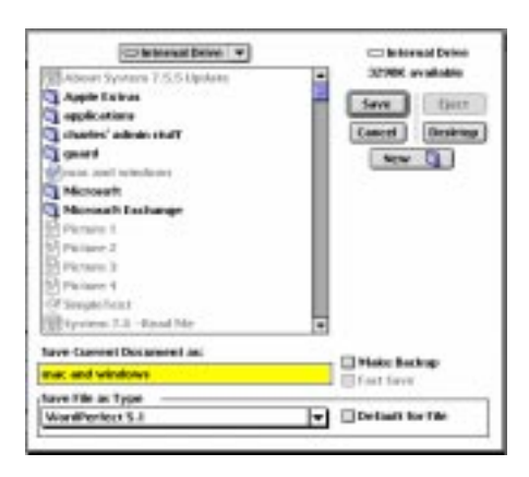
Figure 5. Saving a Word File for WordPerfect

Of course, once you have saved the file into a Windows format, the Mac file will still be shown on your Mac. But if you look on the drive where you saved the file, the new, Windows format file will be there with the Windows title.