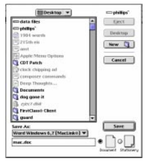
Figure 6 -The ClarisWorks 4 Save As Dialog Box

ClarisWorks is a solid word processor; it has some converters but also depends on MacLink (see Part 2 for more information about MacLink) for a lot of its' translation.