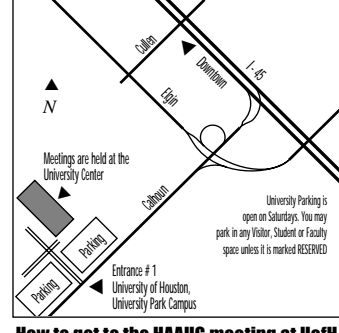
How to get to the HAAUG meeting at UofH

The Houston Area Apple Users' Group provides a forum for the exchange of ideas and information about Apple Computer products and their associated hardware and software. Meetings, newsletters, special interest groups, the BBS and other events create this forum.